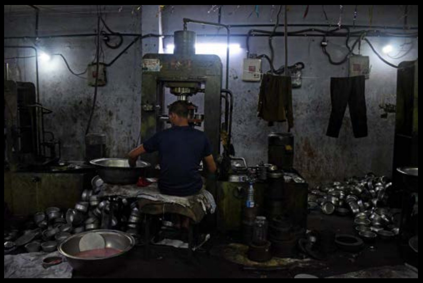
A Worker operates a power-press machine to shape steel containers