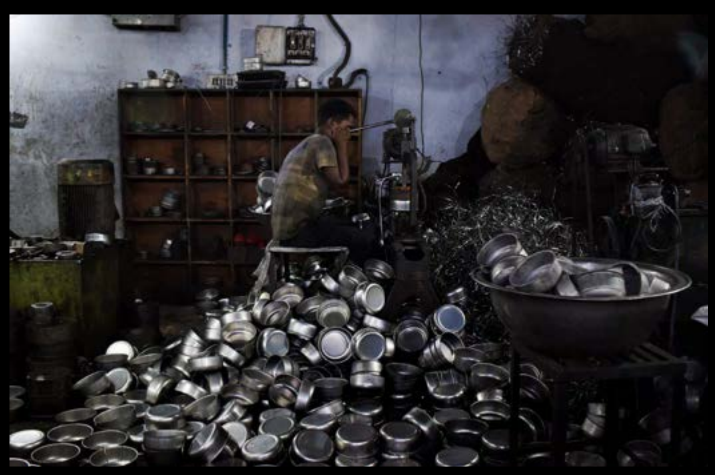
Workers pressing out steel plates to shape containers.