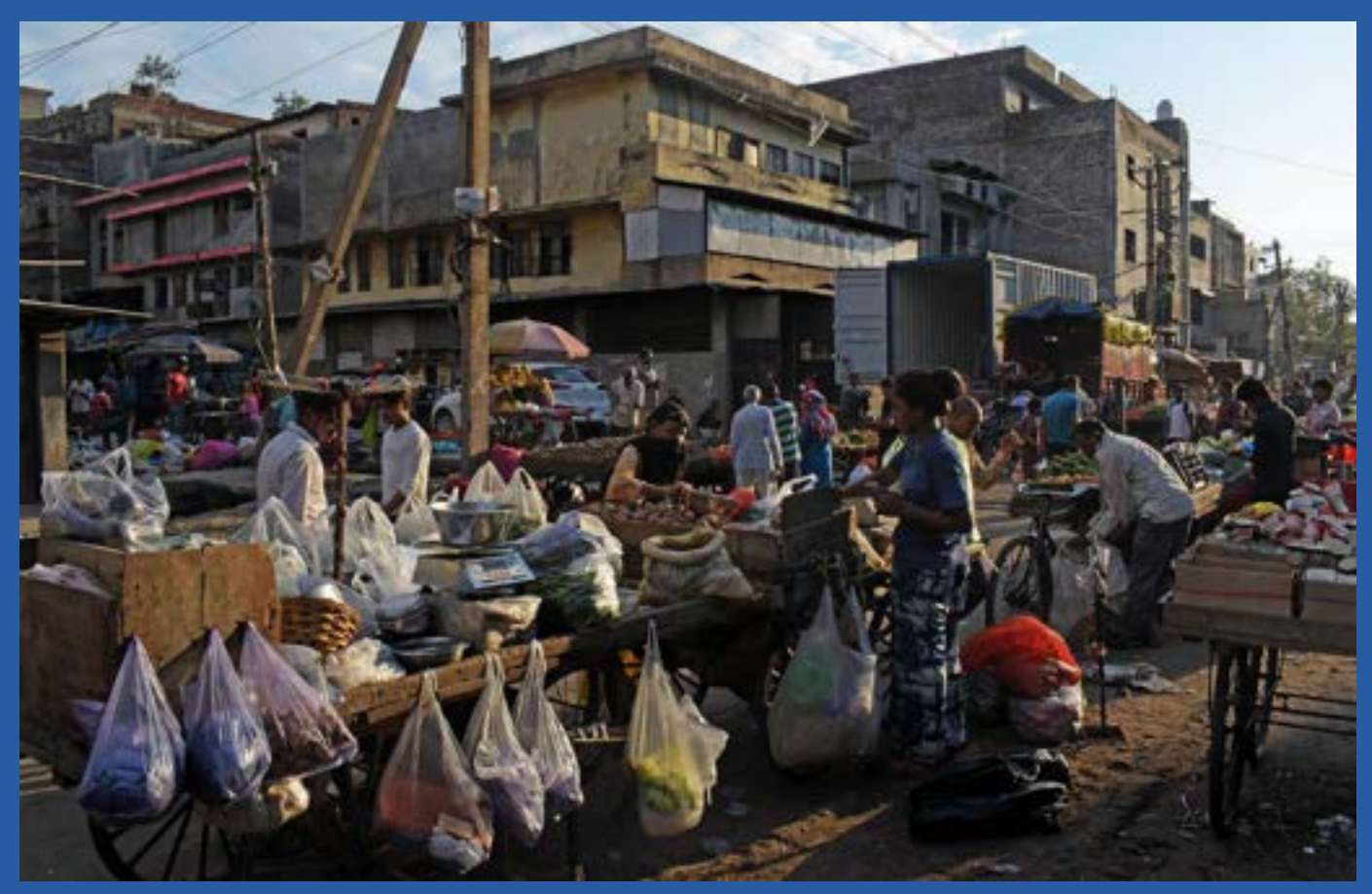
Crowds gather by floating vendors that flood the streets of Wazirpur industrial area. Amidst the clamour of industrial machinery, residents shop for their daily groceries.