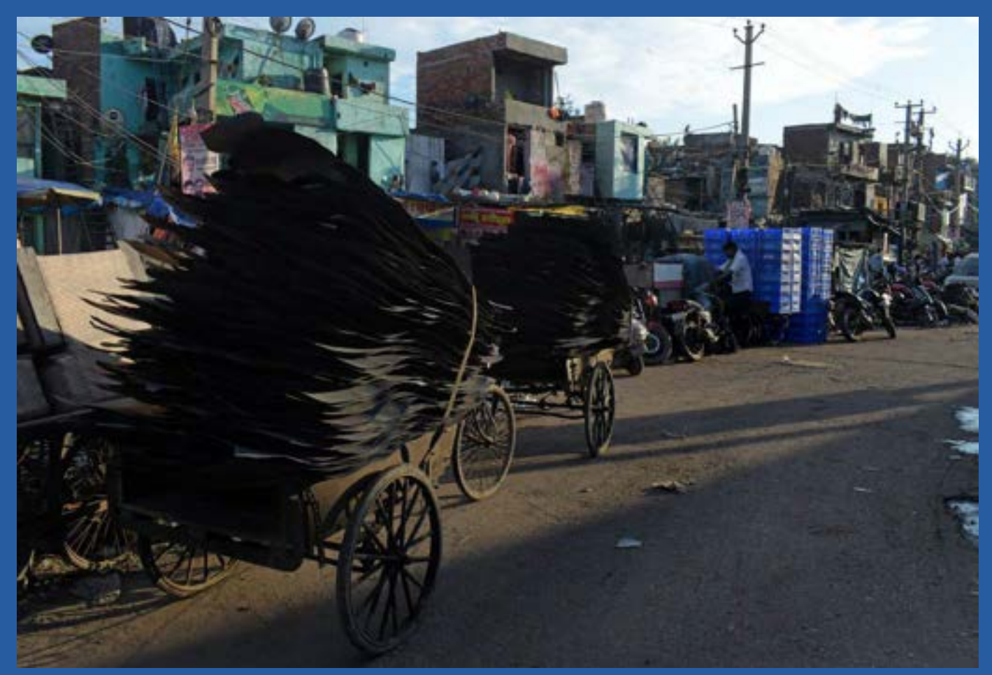
Sheets of pressed steel to be towed away in cycle rikshaws.